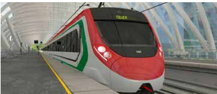
Intercity train Toluca - Mexico DF

With this contract edilon)(sedra will generate a new important reference in Latin America which creates worldwide attention for its high tech rail fastening solutions. The new metro line will provide service to over 300,000 passengers a day and is expected to be in operation end of 2018. Four new stations and two new terminals are planned for. The opening of the line is scheduled for December 2018.