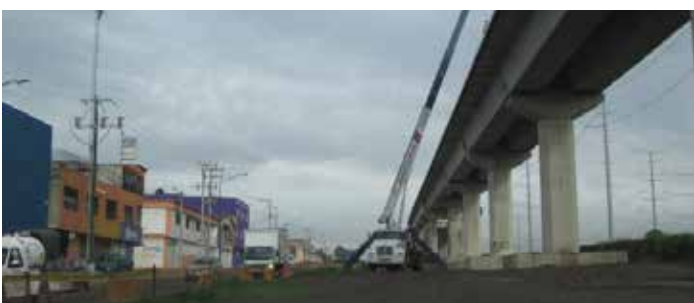
Viaduct Toluca - preparations for the track installation