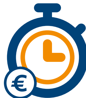
Fast and reliable replacement