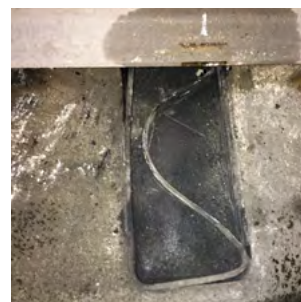
Distorted rubber boots