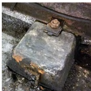
Damaged booted blocks