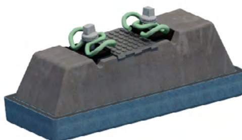
Prefabricated block and integrated tray